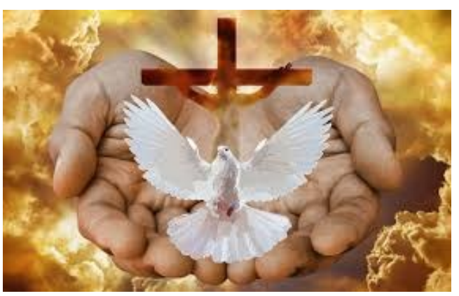
Glory to the Father, the Son, and the Holy Spirit; to God who is, who was, and who is to come. —Revelation 1:8

New to the Parish? New family registration forms are available in the back of the church or you may request one from the parish office.