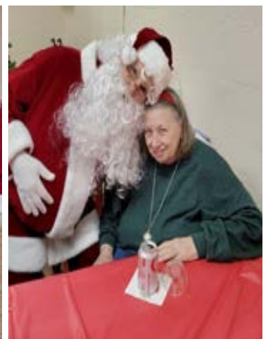
Christmas Party 2024