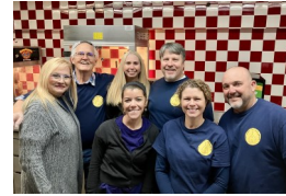
Another fun night at the Concession Stand!