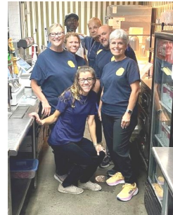
Another successful night at the Concession Stands!

Watch this space for future updates concerning our building project!