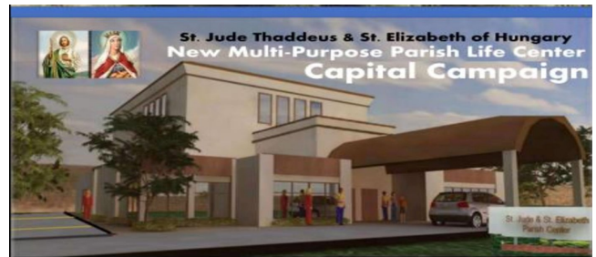
Artist's Conceptual Rendering, Subject to Final Architectural Drawings

Join us for a special Town Hall Celebration and Update THIS SUNDAY, JULY 31st after the 10:30 am Mass. Lunch will be served!